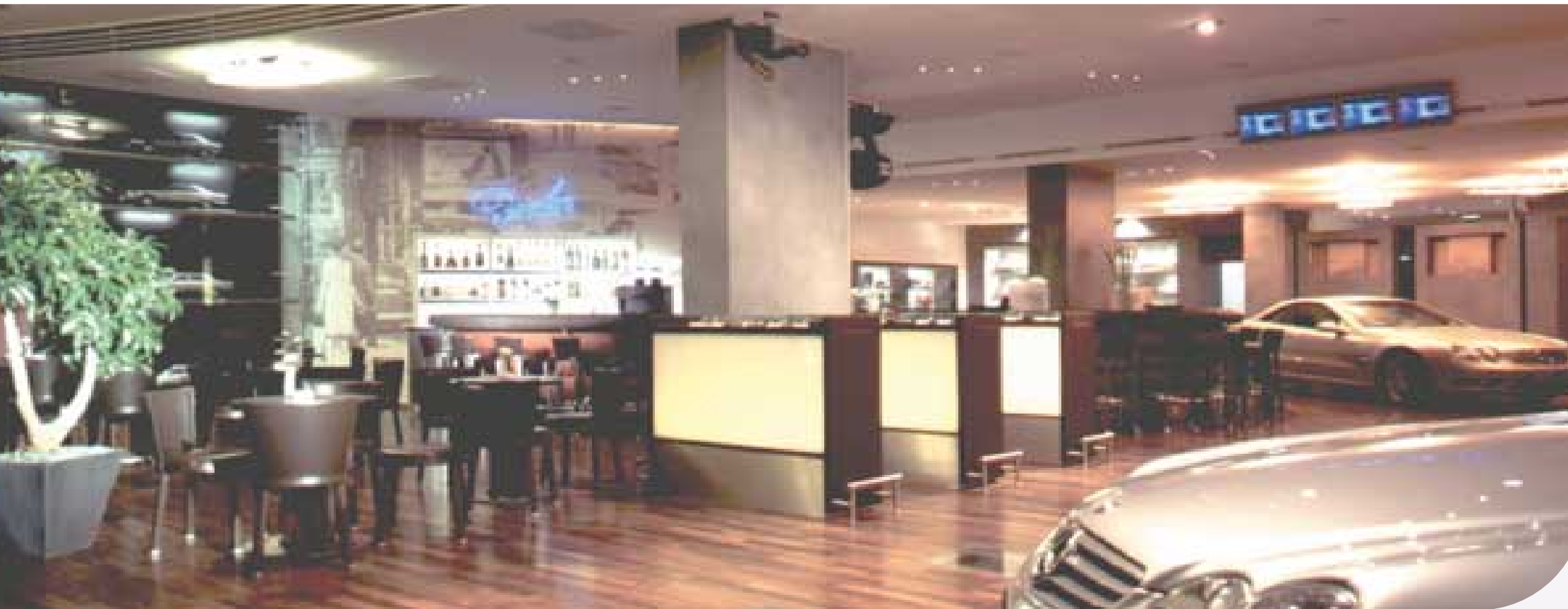
● Lighting was used to help create the right atmosphere in each of the different areas of the Mercedes-Benz showroom.

decided on products from Philips Lighting, first and foremost the Mini whiteSON as downlighters, the basis of the whole lighting design. This is one of the first major projects to use the Philips Mini whiteSON lamps. The decisive factor was the excellent colour rendering of this lamp, with strong accents in the red spectrum. It is combined with ALUline PRO halogen lamps used in the small downlighters.