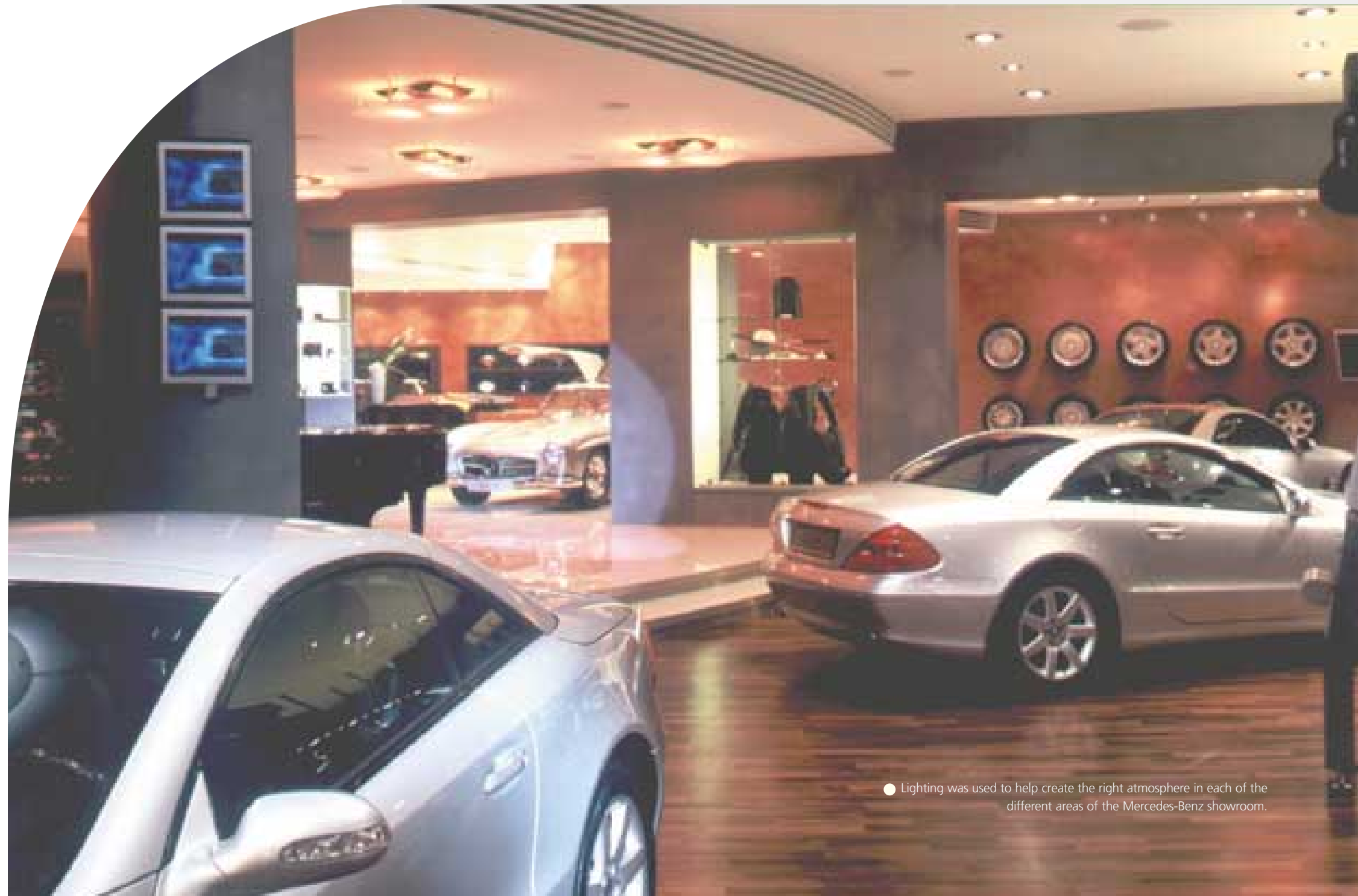
● Lighting was used to help create the right atmosphere in each of the different areas of the Mercedes-Benz showroom.

This Mercedes-Benz showroom project does not represent a move to Germany's capital city by the international company. There has been a Mercedes-Benz showroom at Kurfürstendamm no. 203, the present locality since 1959. It has now undergone a fundamental refurbishment, however. The aim was not only to ►